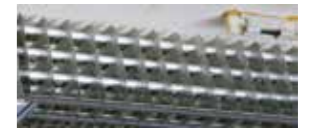
After Defrost Process