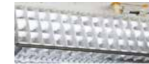
Before Defrost Process